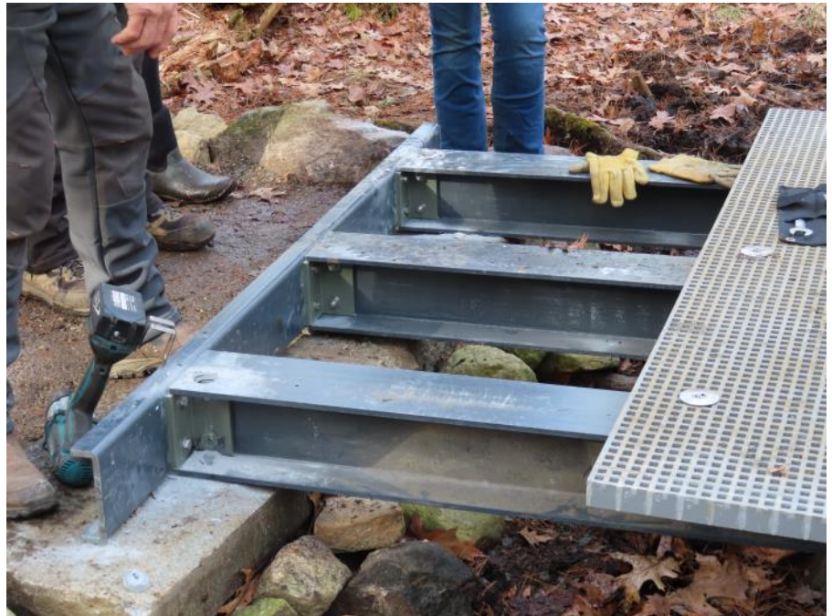
Bridge frame and decking all out of fiber-reinforced polymer.

The 6 foot wide and 12 foot long bridge is made completely out of fiber-reinforced polymer or FRP for short