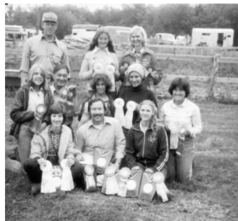
Judged Pleasure Winners Aug. 19, 1979