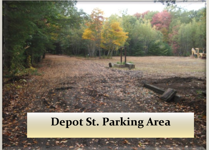
Depot St. Parking Area