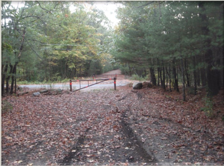
Yew St. crossing heading West