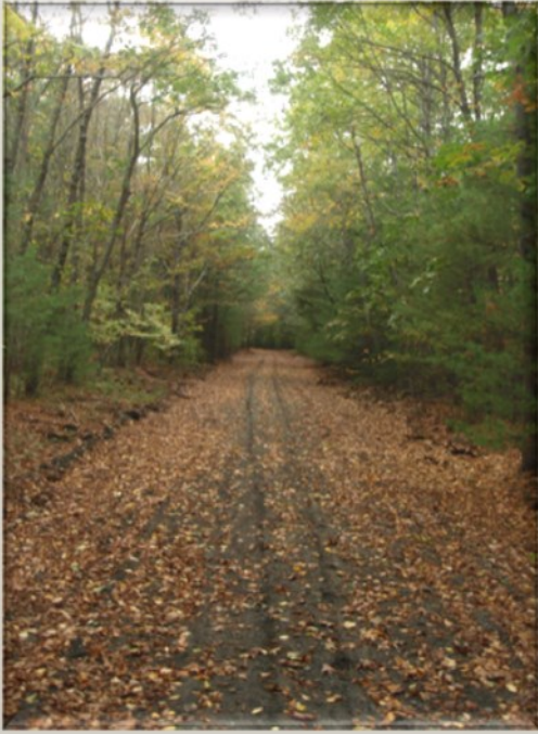
Monroe St. heading West