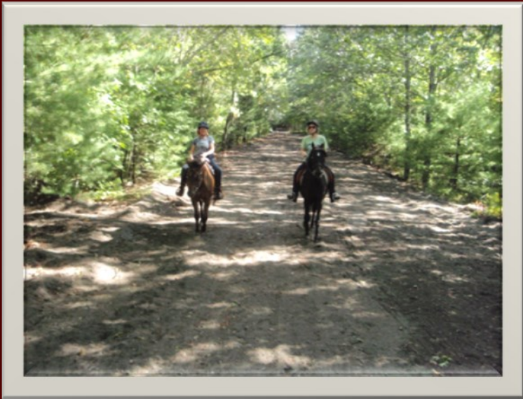
Riders enjoying the trail