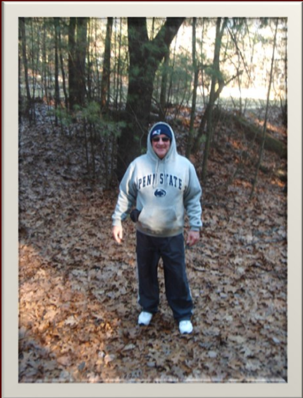
New Year's Day on the SNETT