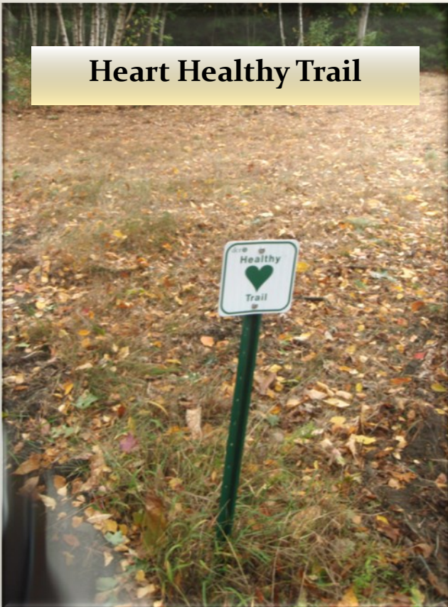
Heart Healthy Trail