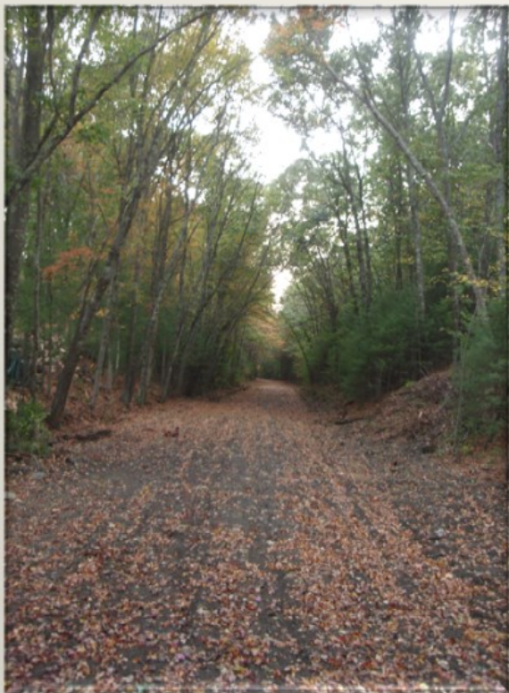
South East Main St. Crossing