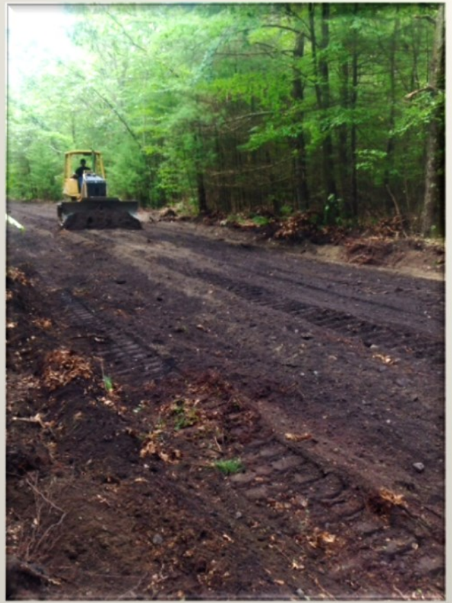
Work on the SNETT by Speroni Excavation